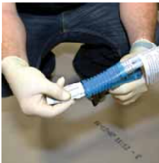
Application of petroleum jelly to spray gun