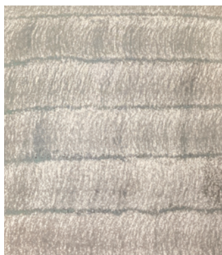
Proper Coverage on Insulation