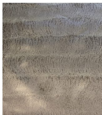
Proper Coverage on Membrane